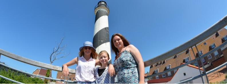
Le Phare de Petit-Fort-Philippe

116 steps to climb to a beautiful view !